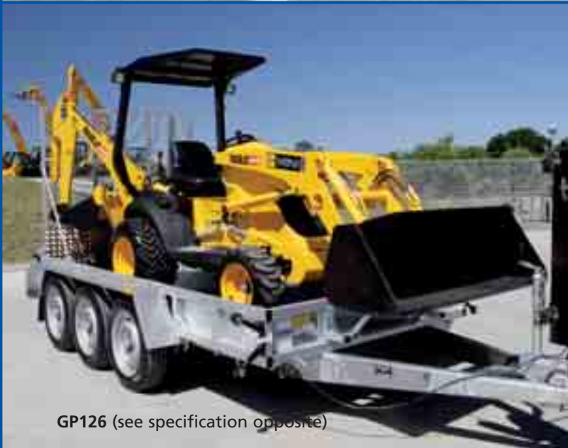
GP126 (see specification opposite)