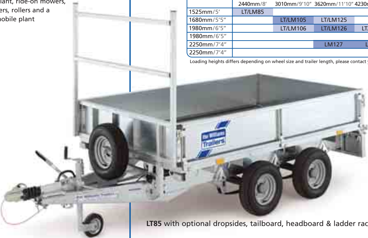
LT85 with optional dropsides, tailboard, headboard & ladder rack

Loading heights differs depending on wheel size and trailer length, please contact your local distributor for more information.