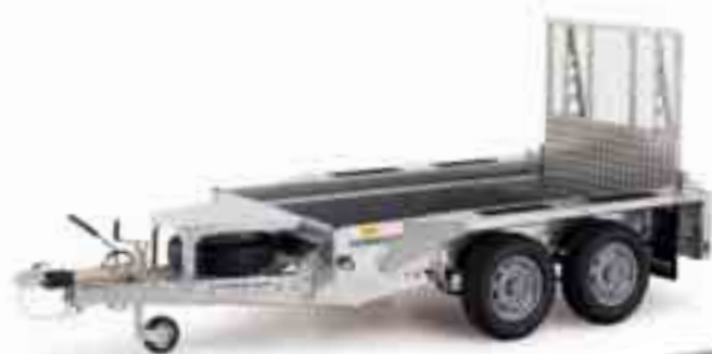
GX84 with ramp