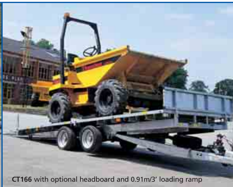
CT166 with optional headboard and 0.91m/3' loading ramp

For owners of vehicles with low ground clearance or those in the vehicle recovery business, the tiltbed is an ideal choice. It provides all the benefits of the flatbed range, combined with an easily-tilted platform for effortless loading.