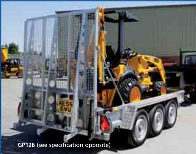
GP126 (see specification opposite)