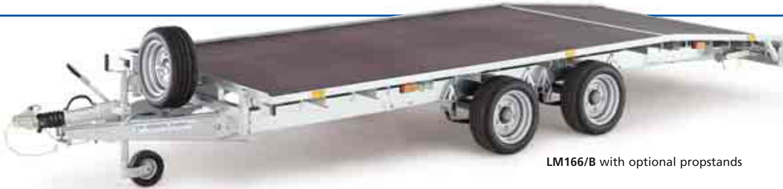
LM166/B with optional propstands

Vehicles with low ground clearance may not be suitable for loading on this type of trailer.