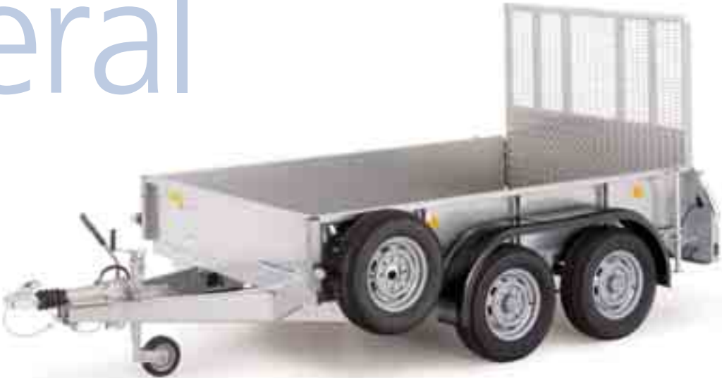
GD85 with ramp