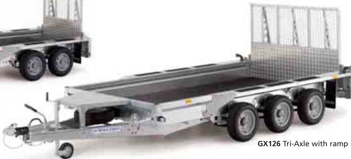
GX126 Tri-Axle with ramp