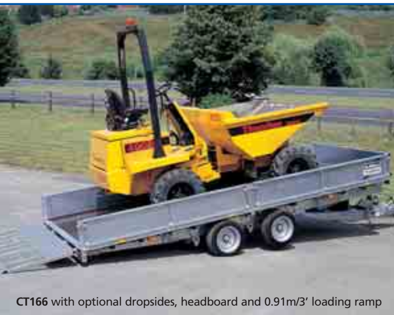
CT166 with optional drop sides, headboard and 0.91m/3' loading ramp