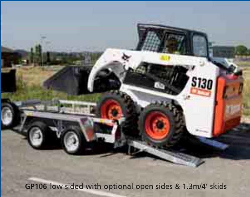
GP106 low sided with optional open sides & 1.3m/4' skids

High sided models come with filled in sides, an optional bucket rest and axles which are more centrally positioned. This option is ideally suited to users who require flexible usage from their trailer; a reliable plant trailer providing higher sides for use as a general duty trailer.