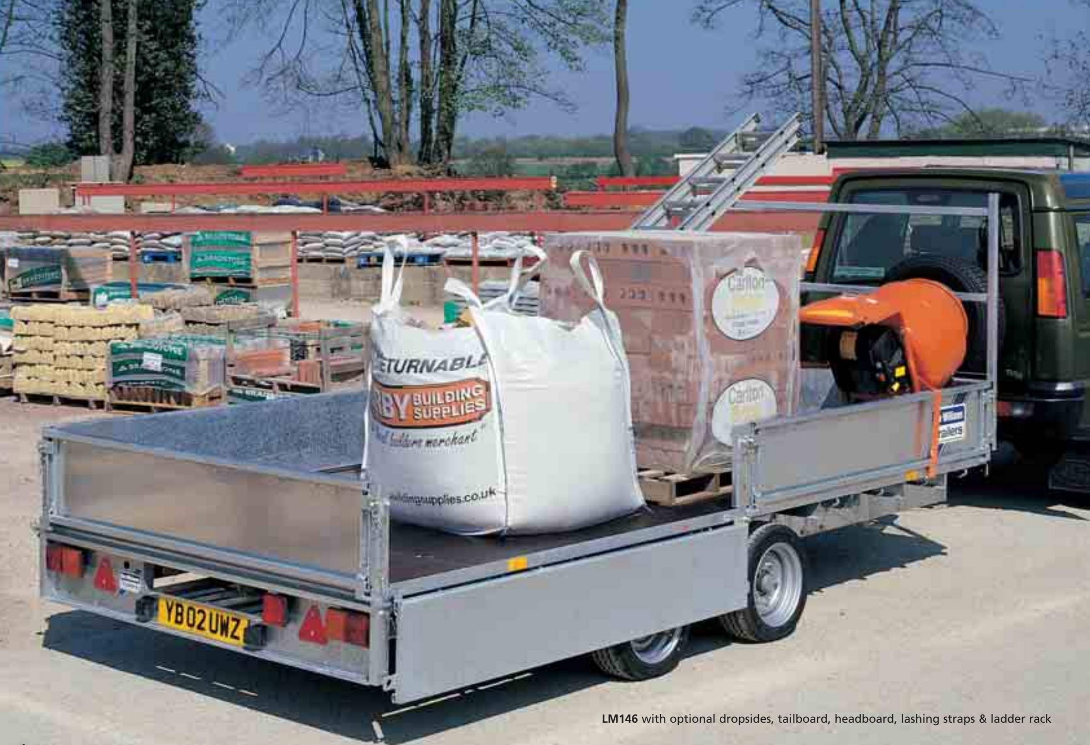
LM146 with optional drop sides, tailboard, headboard, lashing straps & ladder rack