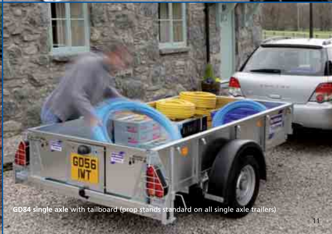
GD84 single axle with tailboard (prop stands standard on all single axle trailers)