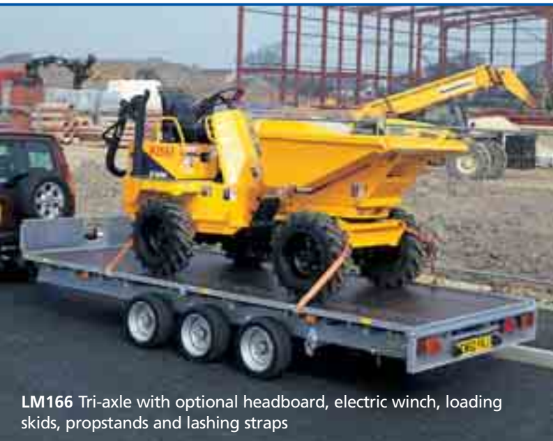
LM166 Tri-axle with optional headboard, electric winch, loading skids, propstands and lashing straps

The maximum gross weight for the LT model is 2000kg, whilst the heavier LM models offer between 2700kg and 3500kg.