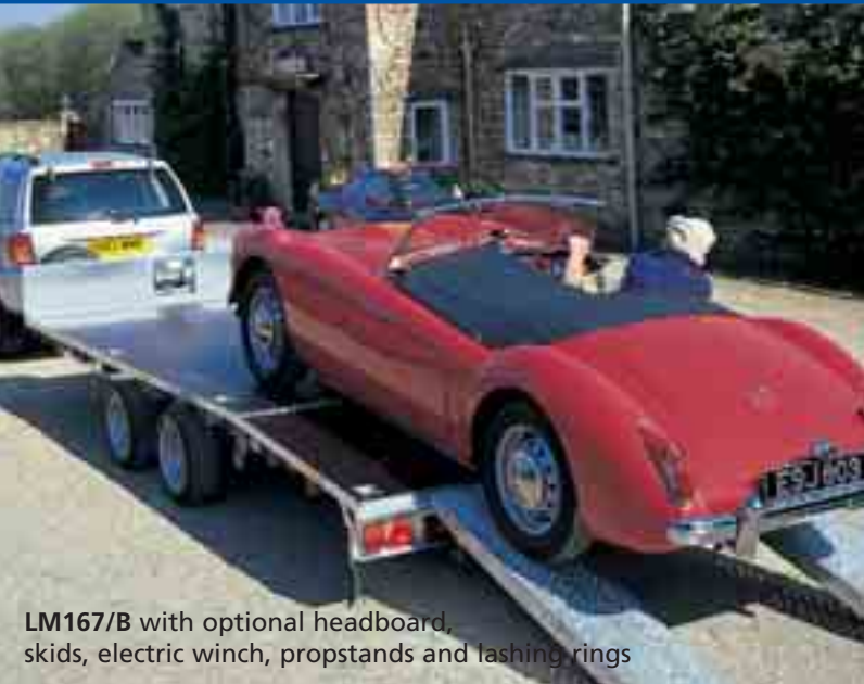
LM167/B with optional headboard, skids, electric winch, propstands and lashing rings