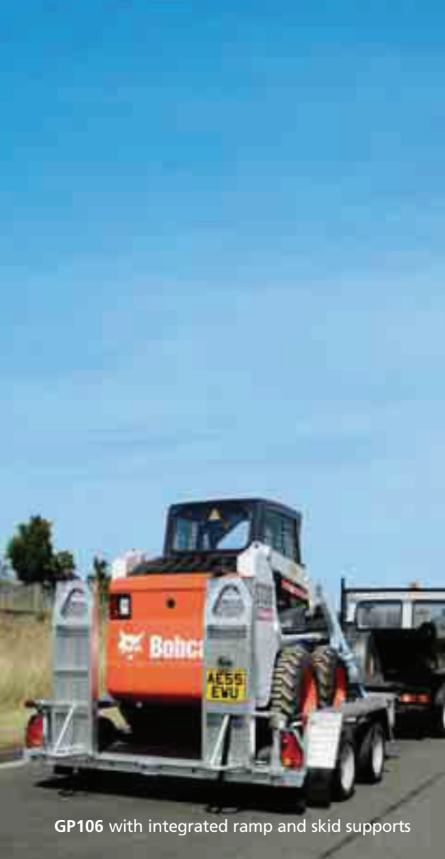
GP106 with integrated ramp and skid supports

Product design, descriptions, colours, specifications etc. correct at time of going to press. We constantly strive to improve our products, and from time to time this may result in changes to our range or to individual models. Please check that design, description, colours, specifications described in this brochure are still valid at the time of placing an order.