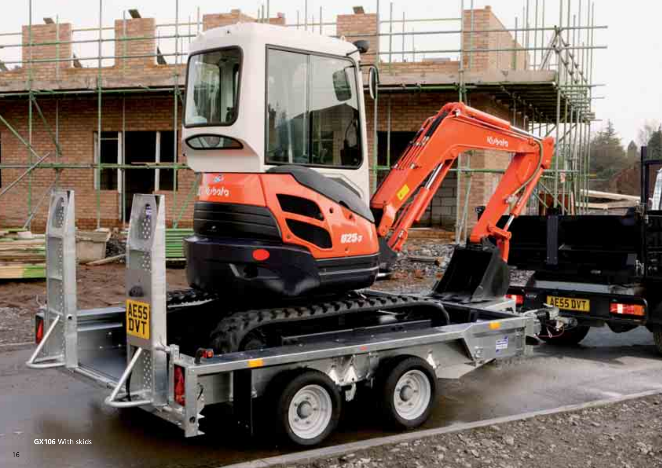
GX106 With skids