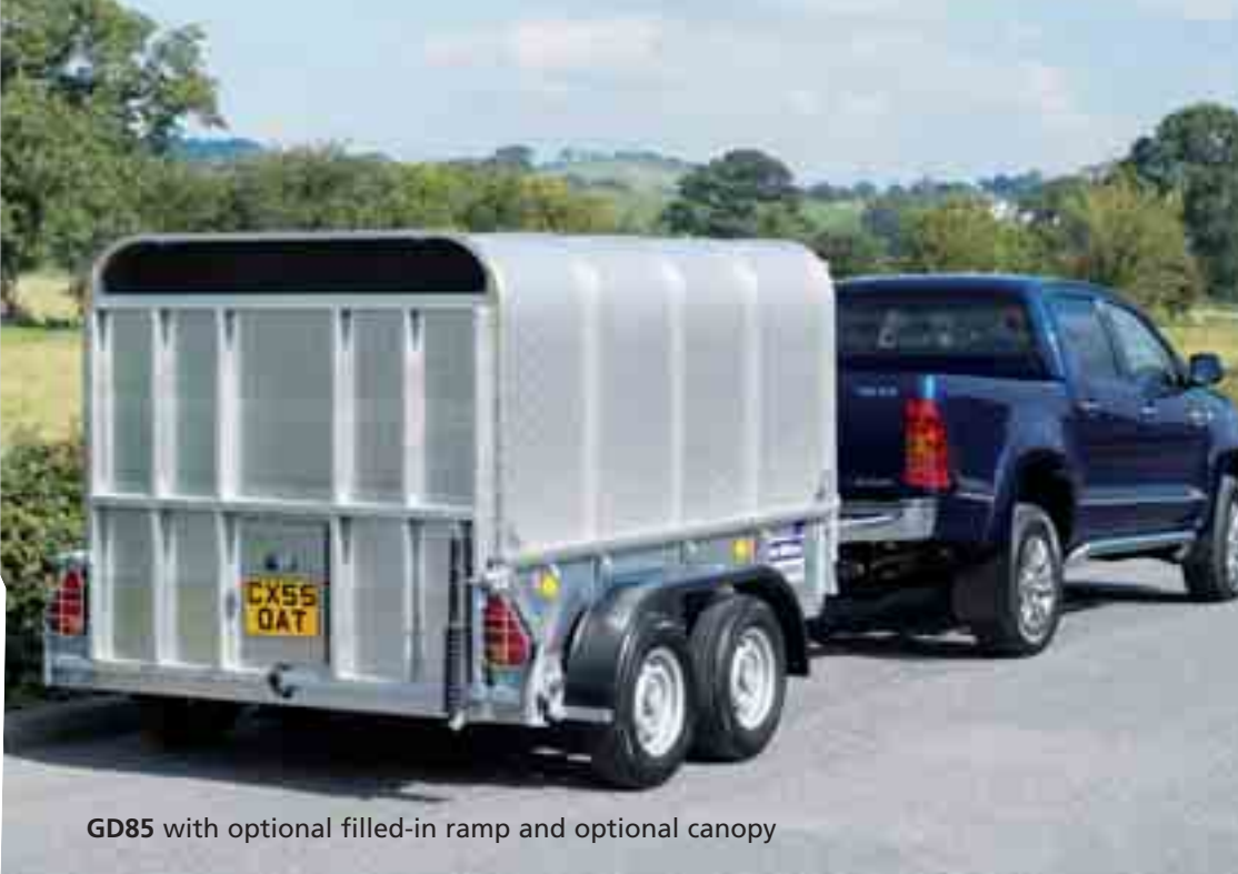
GD85 with optional filled-in ramp and optional canopy