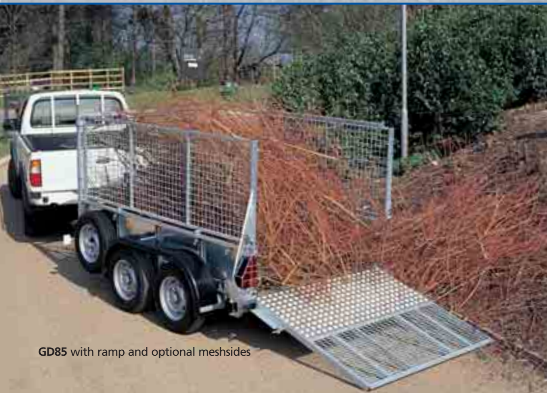
GD85 with ramp and optional meshsides