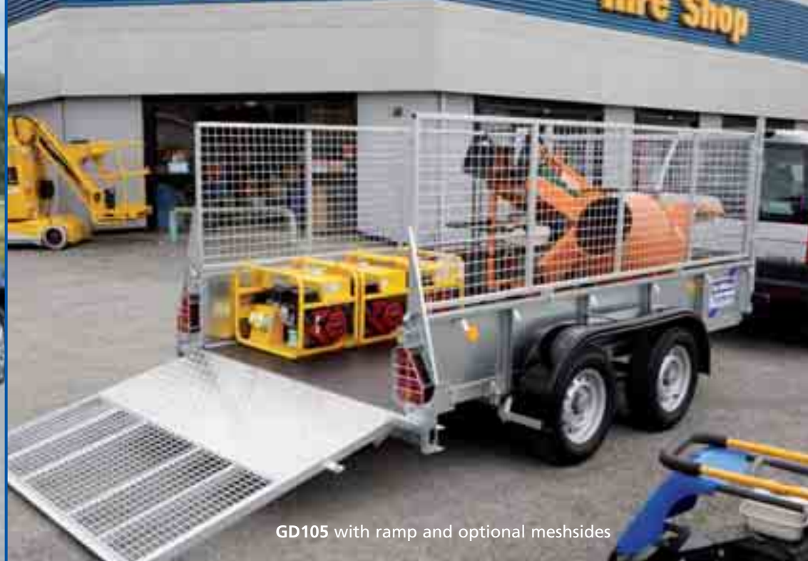
GD105 with ramp and optional meshsides