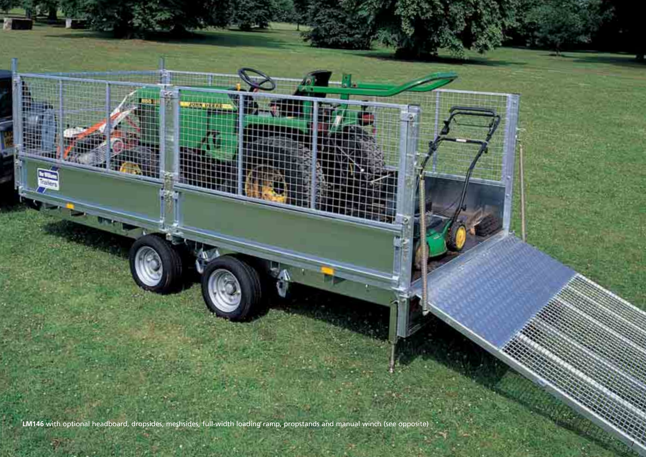
LM146 with optional headboard, dropsides, meshsides, full-width loading ramp, propstands and manual winch (see opposite)