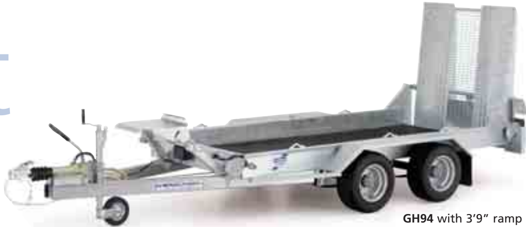
GH94 with 3'9" ramp