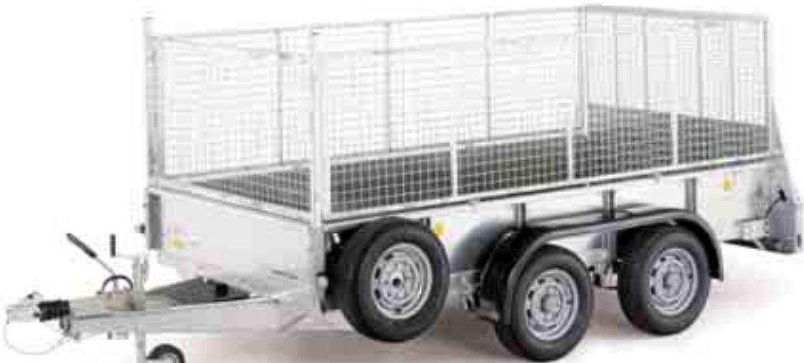
GD105 with ramp and optional meshsides