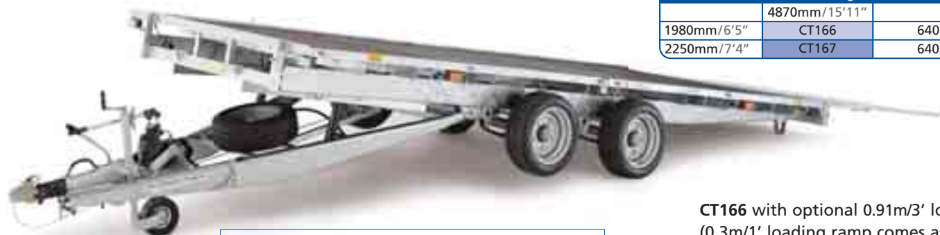
CT166 with optional 0.91m/3' loading ramp (0.3m/1' loading ramp comes as standard)