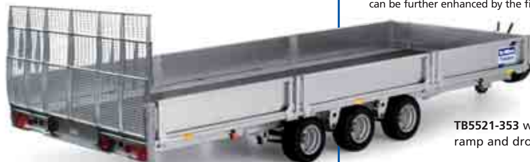
TB5521-353 with mesh rear ramp and drop sides.

In addition to the CT166 & 167 we have a new tiltbed series available offering six trailer models in a range of four lengths, two of which are available in a tri-axle version, and all offer a generous width of 2100mm (7'). Ideal for a range of vehicles including excavators and rollers. Please see our dedicated tiltbed brochure for more details.