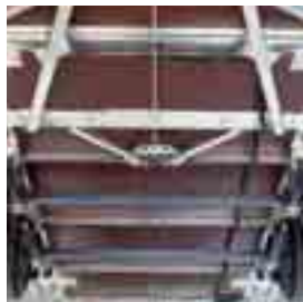
Chassis & floor

It's the attention to detail of Ifor Williams trailers that makes our products so popular with owners. Just take a look at these standard features.