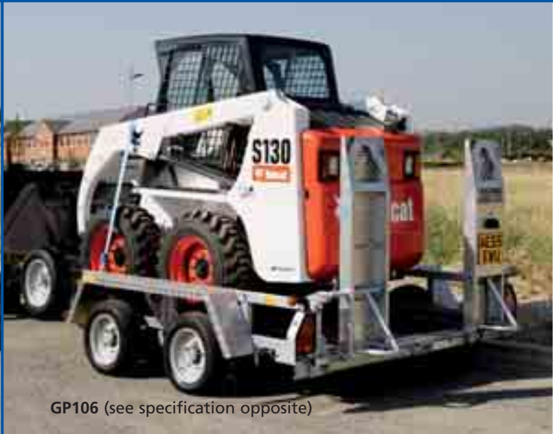
GP106 (see specification opposite)