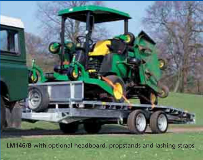
LM146/B with optional headboard, propstands and lashing straps